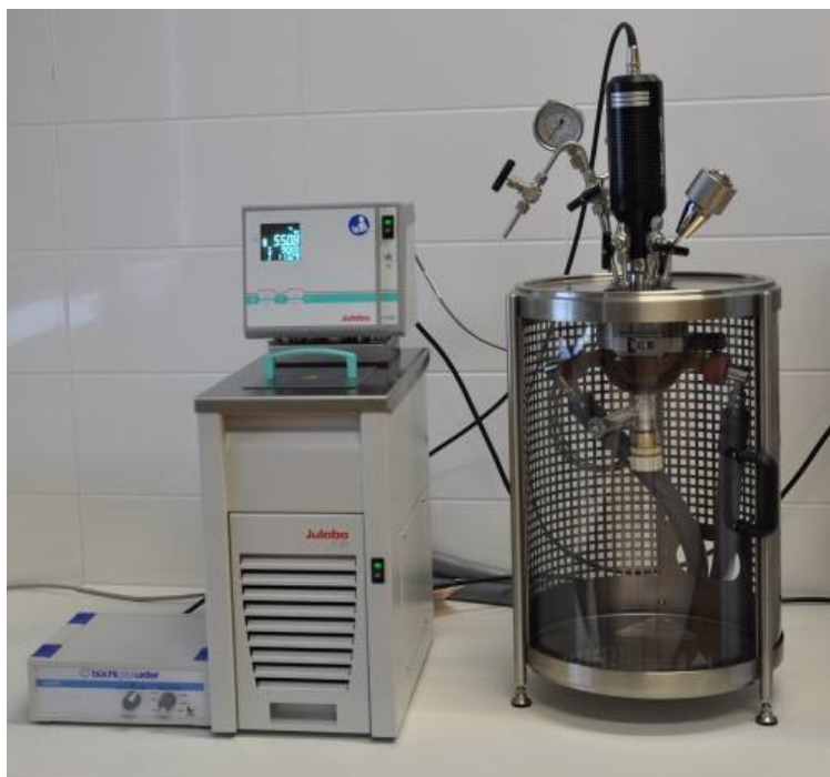
Picoclave (Büchiglas Uster)

Benzene hydrogenation under autoclaving conditions